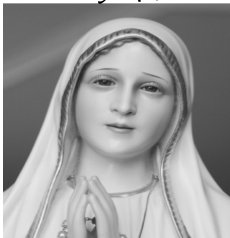
International Traveling Statue Has Arrived at Holy Family Today