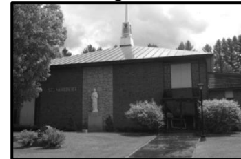
St. Norbert (Hardwick)