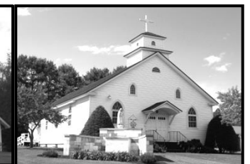
Our Lady of Fatima (Craftsbury)

Parish Office: 193 South Main St. – P.O. Box 496, Hardwick, VT 05843