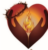
Heart of Jesus