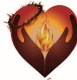
Heart of Jesus