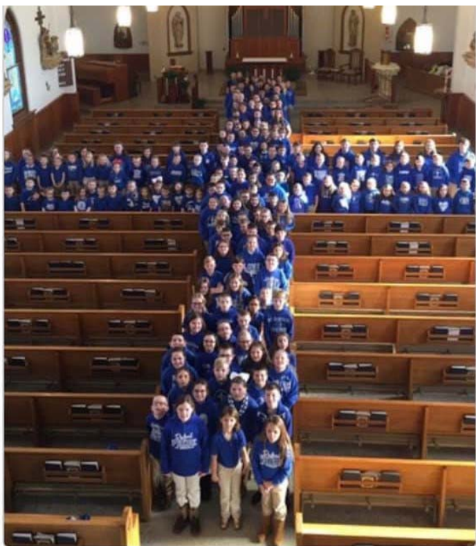
Celebrating Catholic Schools Week