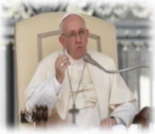
Pope Francis The Beatitudes