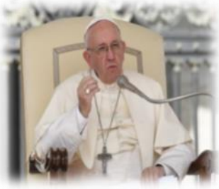
Pope Francis “Pure of Heart”