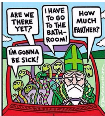
St. Patrick driving the snakes out of Ireland.

Filed on location in Assisi and at other actual locations where St. Francis lived and died, this feature film vividly tells the story of the greatly beloved saint from childhood to his death. Beautifully filmed with outstanding cinematography and fine acting talent, this film stars Italian actor Raoul Bova as Francis and was directed by acclaimed filmmaker Michele Soavi. Captured by the enemy as a soldier and put in prison, he has a life-changing experience that inspires him after being freed to abandon his riches and dedicate his life to living the Gospel in simplicity, poverty, and charity towards all. Find this and more on the formed website. Access Code VZ4F2W or download the free app for your phone.