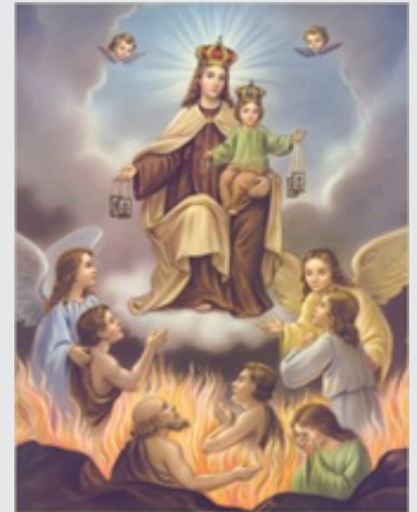
+Our Lady of Mt. Carmel+ Pray for us!

To browse options for buying a (handmade) scapular (and supporting a convent) go to http://www.sistersofcarmel.com/ .