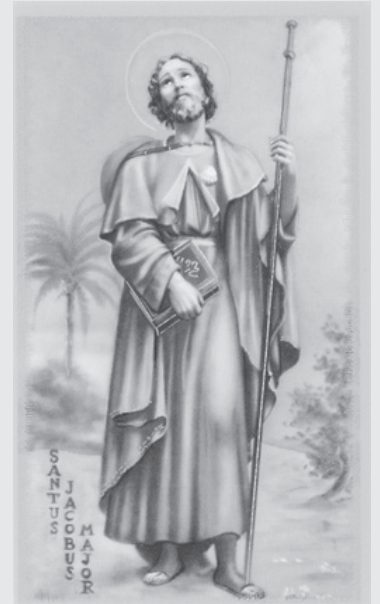
+St. James, Pray for us!+

O glorious Apostle, St. James, who by reason of thy fervent and generous heart was chosen by Jesus to be a witness of His glory on Mount Tabor, and of His agony in Gethsemane; thou, whose very name is a symbol of warfare and victory: obtain for us strength and consolation in the unending warfare of this life, that, having constantly and generously followed Jesus, we may be victors in the strife and deserve to receive the victor's crown in heaven. Amen.