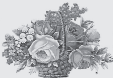
Altar flowers have been donated anonymously in honor of Jesus in the Holy Eucharist

Thank you to those who have made a pledge or payment to the BAA Annual Appeal! The parish has now met the Diocesan goal which means any monies donated from this point forward will come back to the parish 100%. If you have not already done so, please consider a pledge or donation to the Appeal. Every one dollar counts and no donation is too small.