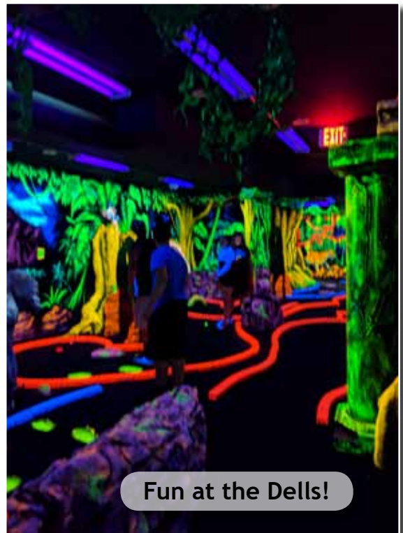
Fun at the Dells!

After all of this, the teens got to enjoy a day of fun at the Wisconsin Dells. We enjoyed Noah's Ark Water Park, played laser tag, attempted to navigate a laser maze, played 3-D miniature golf, and walked the strip. Each morning began with Morning Prayer of the Liturgy of the Hours, and each night ended with Evening Prayer of the Liturgy of the Hours. Besides Liturgy of the Hours, several opportunities were offered for prayer. During these type of trips, it is always a great thing to see so many teens growing in faith and love for Jesus Christ and His Church.