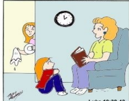
Luke 10:38-42 "Yes dear...I know all about the story of 'Mary and Martha'...but you still have to help your sister with the dishes!"

Corn feed tickets are in the front entrance of the church this weekend. Those not picked up will be mailed. Ticket money may be dropped off at the parish office or placed in the weekend collection basket in a separate, labeled envelope. All tickets need to be returned to the parish by August 18th. If you need additional tickets please call or stop by the parish office. Read the letter in your envelope for more details.