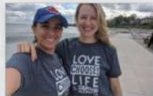
Walk for Life