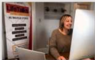
Life Talks Conference

Covid lockdown started 2 weeks before our annual pro-life educational conference so we quickly pivoted to an online format.