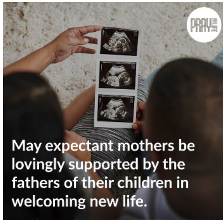
May expectant mothers be lovingly supported by the fathers of their children in welcoming new life.