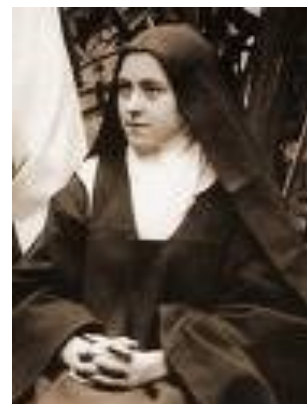
St. Therese of Lisieux

Is an introductory five week study of the Doctors of the Church whose tremendous erudition and insight have been of fundamental importance in the development of Church learning .