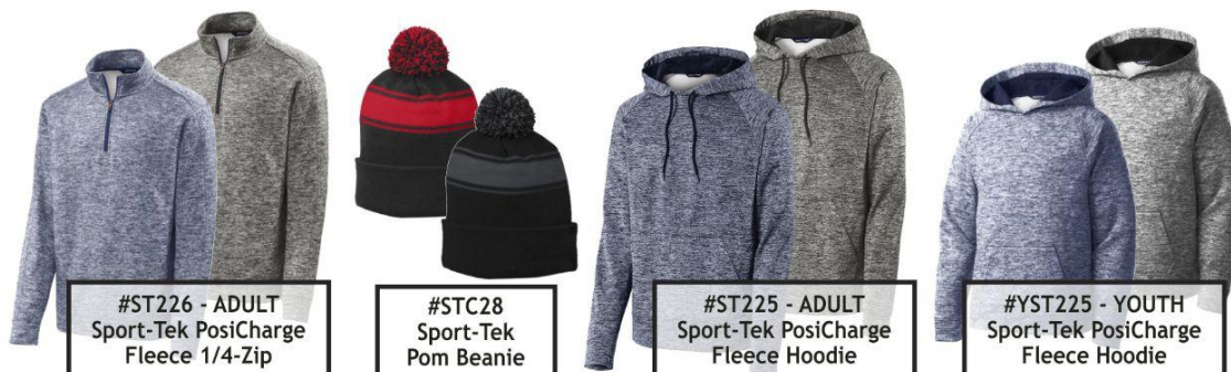
#ST226 - ADULT Sport-Tek PosiCharge Fleece 1/4-Zip