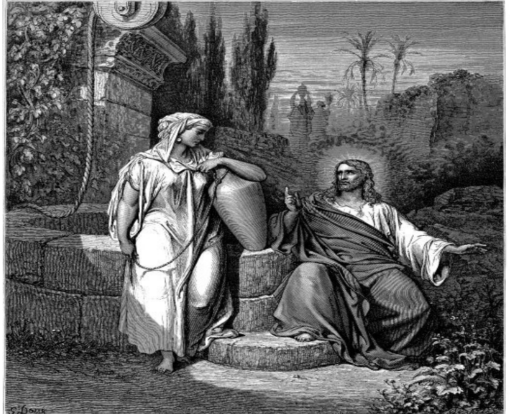
"Jesus and the Woman of Samaria" by Gustave Doré

We, the people of St. William Roman Catholic Church, are a distinctive community located in southeastern Kentucky. Our purpose is to advance the spiritual growth of our members; to respond to needs inside and outside our community; to create opportunities for evangelization, ecumenism and the promulgation of our faith; and to respond to the many opportunities for growth before us.