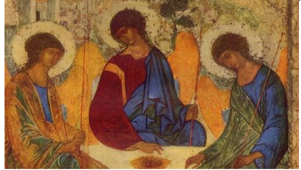
Holy Trinity by Andre Rublev

We are on the web: saintwilliamcatholicchurch.org