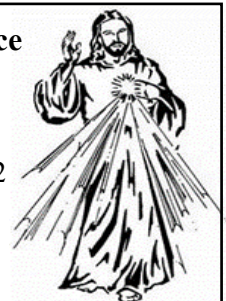
Jesus I Trust In You