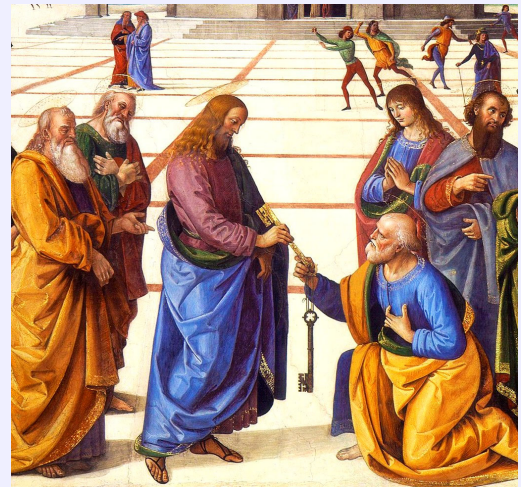
Christ Handing the Keys to St. Peter by Pietro Perugino (1481 - 82) Fresco, 335 x 550 cm Cappella Sistina, Vatican.