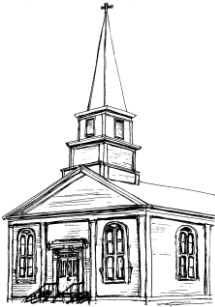
St. Andrew's Church, Waterbury