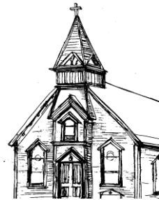
St. Patrick's Church, Moretown