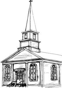
St. Andrew's Church, Waterbury