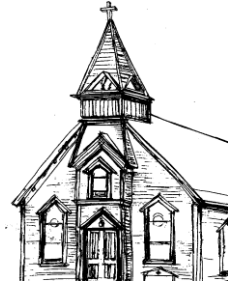
St. Patrick's Church, Moretown