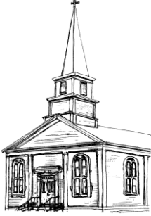
St. Andrew's Church, Waterbury