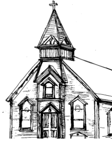
St. Patrick's Church, Moretown