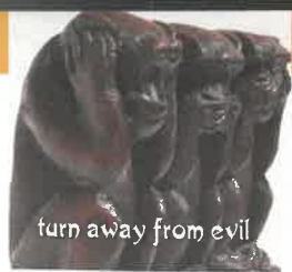
turn away from evil

Do not be wise in your own eyes, fear the LORD and turn away from evil. Proverbs 3:7