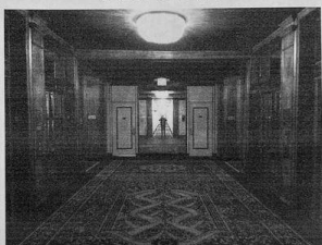
MURDER AT THE WALGRAVE ASTORIA

St. Michael Offertory Collection $ 2875. 00 St. Dominic Offertory Collection $ 1479. 00