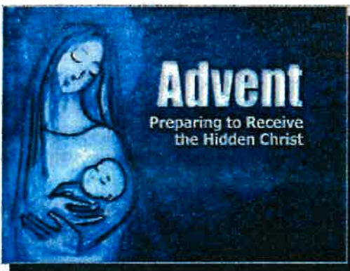
Catholic World Report

While some Christians fixate upon the return of Christ to the point that little else matters, Catholics should—especially during Advent—gaze upon and receive the Eucharist, knowing that it is why anything matters at all. In doing so, we proclaim his coming, anticipating the culmination of time and history.