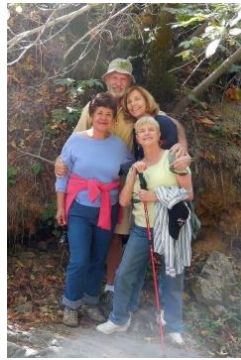
Tribute Trail Hike