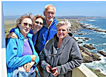
Pt. Arena Lighthouse Overnight