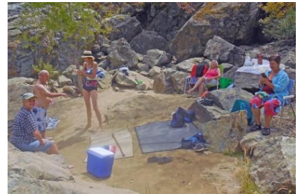
South Yuba Swim Trip