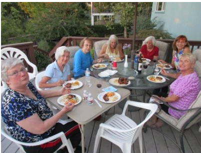
Backyard BBQ Dinner