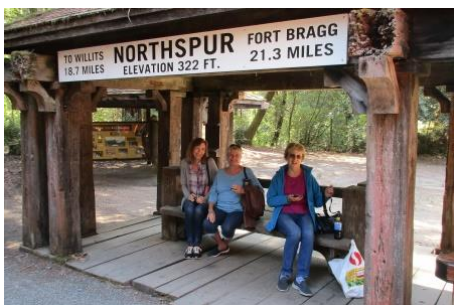
Skunk Train Ride