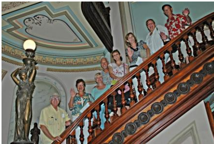
Crocker Museum Day Trip