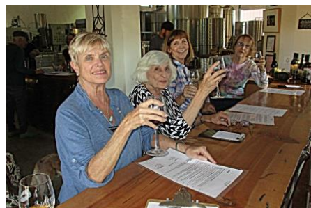
Wine Tasting in Jackson