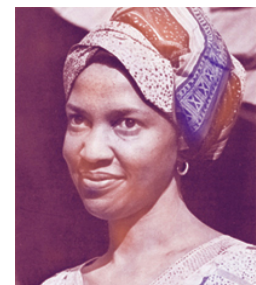
Sister Thea Bowman