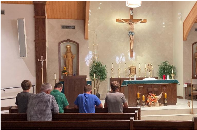
High School Boys Adoring 12:00 -1:00 AM

Thanks to all who spent time with Our Lord in Adoration on October 3 and 4! It is estimated that there were about 120 holy hours made and rosaries said over the 24-hour period.