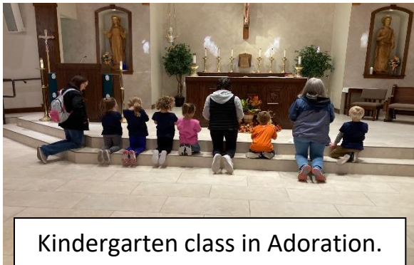
Kindergarten class in Adoration.

All You Holy Men and Women, Pray for Us. Saints drawn by our very own CCD students.