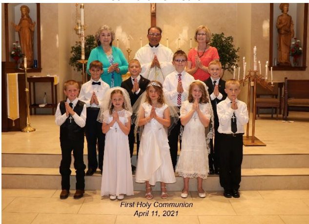
First Holy Communion April 11, 2021