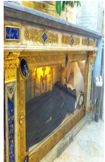
The incorrupt body of St. Catherine Labouré in the Chapel of Our Lady of the Miraculous Medal, Paris, France