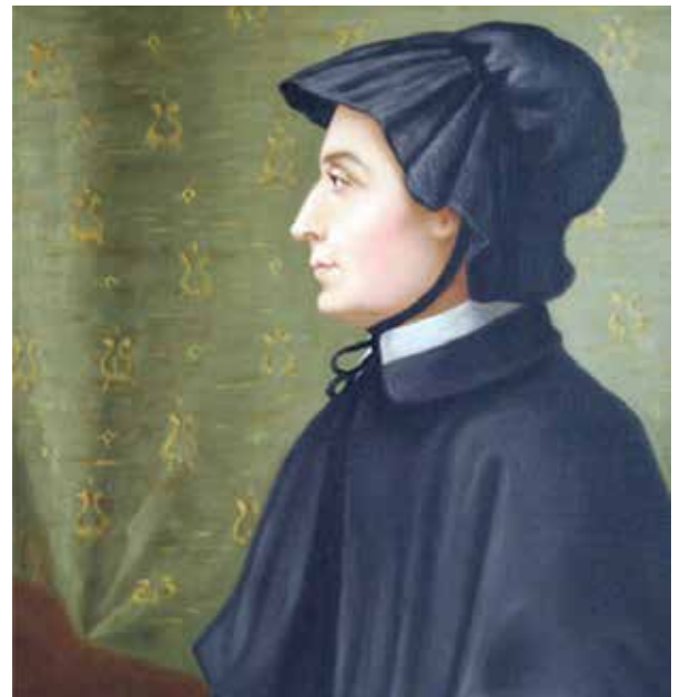
ST. ELIZABETH SETON WINDOW Memorial $115,000.00