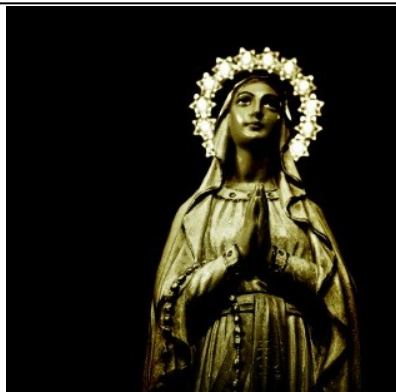
Most Holy Name of Mary, 9/12/2020