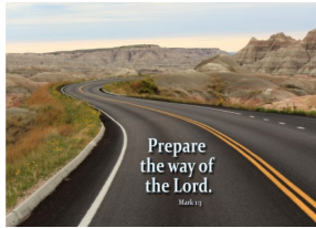
Today's Missal, 6/7/20-11/28/20