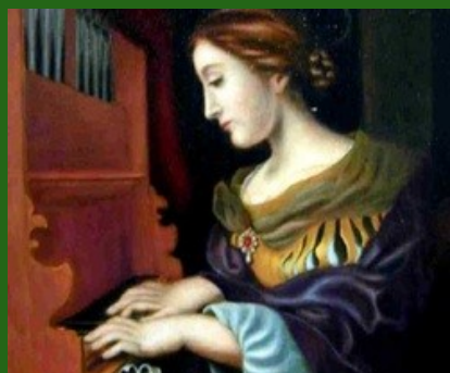
St. Cecilia, Virgin & Martyr November 22