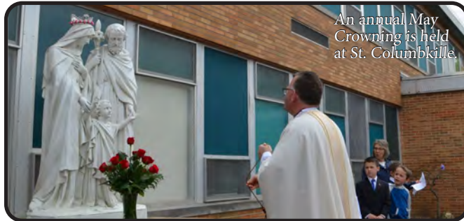
An annual May Crowning is held at St. Columbkille.

Please share photos of your May Crowning with us at: https://www.facebook.com/FM98.3KCRDDUBUQUE/ .