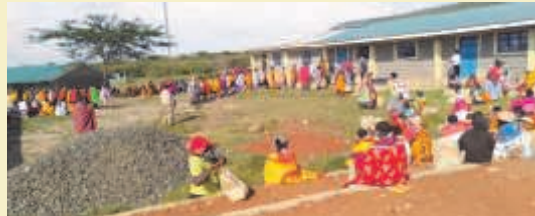
Feeding Maasai Village Families