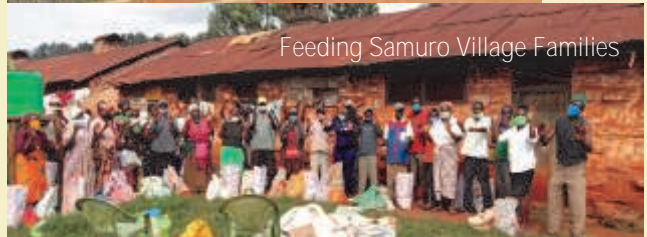
Feeding Samuro Village Families

There are over 400 families in the Maasai Villages and 42 families in the Samuro Village who are being helped during these trying times. The three Maasai leaders purchased and distributed the food for their people and local Helping Hands Volunteers purchased and distributed the food for the Samuro Village families. They all were so very thankful and sang praises to God to think people who didn't know them cared enough to reach out at this time.