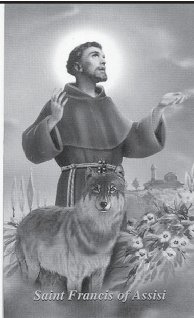
Saint Francis of Assisi

In your infinite wisdom, Lord God, when You created the universe you blessed us with all living creatures. We especially thank you for giving us our pets who are our friends and who bring us so much joy in life. Their presence very often helps us get through trying times. Kindly bless my pet. May my pet continue giving me joy and remind me of Your power. May we realize that as our pets trust us to take care of them, so we should trust You to take care of us, and in taking care of them we share in Your love for all Your creatures. Enlighten our minds to preserve all endangered species so that we may continue to appreciate all of your creations. Grant this through Christ our Lord. Amen.