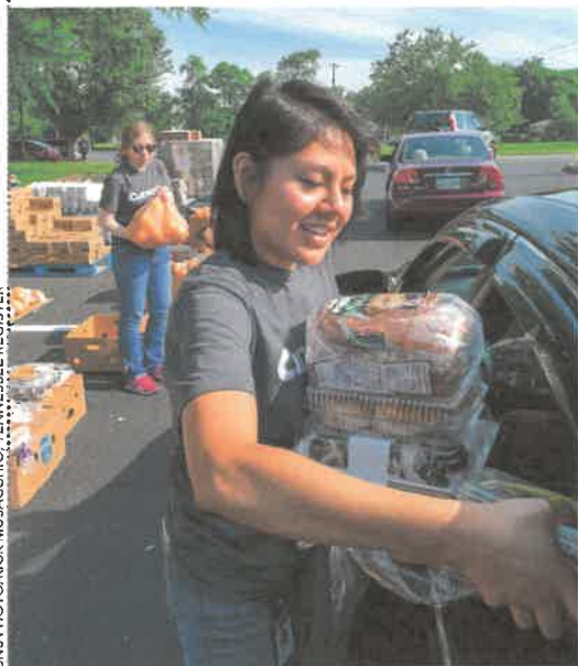
In the poor, Jesus is with us. Here, volunteers work at a food pantry in Nashville.