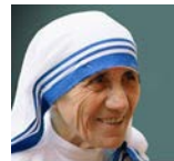
Blessed Teresa of Calcutta

We desire to be able to welcome Jesus at Christmas-time, not on a cold manger of our heart, but in a heart full of love and humility, in a heart so pure, so immaculate, so warm with love for one another.