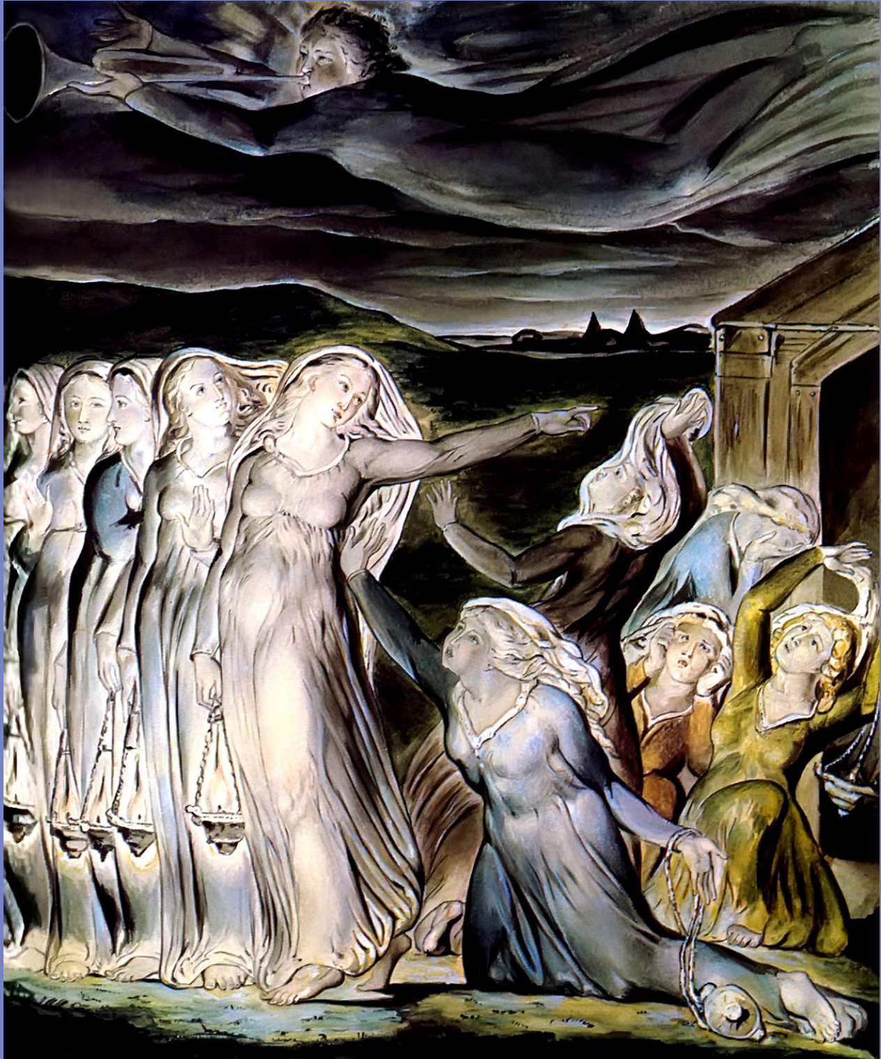
The Wise and Foolish Virgins [William Blake, 1826]