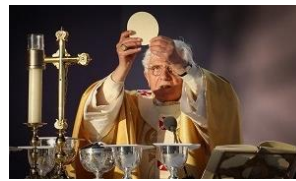
THE MASS LIVE STREAMED