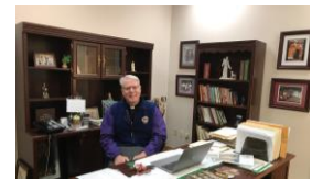
MEETINGS - VIDEO CONFERENCING ZOOM