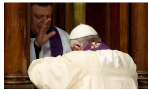
SACRAMENT OF RECONCILIATION By APPOINTMENT