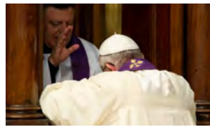
SACRAMENT OF RECONCILIATION By APPOINTMENT