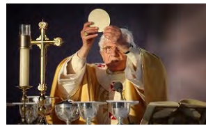
THE MASS LIVE STREAMED