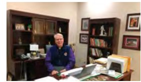
MEETINGS - VIDEO CONFERENCING ZOOM