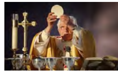
THE MASS Sat vigil - 5:00 PM (In the church) Sunday - 7:30, 9:00 & 11:00 Mon-Sat - 9:00am