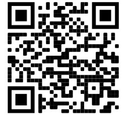
^^ Scan to Join! ^^

Are You "Lost"? So while many of you are aware, some might not know that St. Jerome uses a new and exciting email-text service called Flocknote! Flocknote sends texts, emails and other communications from the Pastor/Staff of a church to all those who are signed up so a church can more easily and directly get important information, updates and seasonal reflections to their "flock". We already have many parishioners signed up, but we are looking to add to our numbers! If you are interested in receiving flocknote messages, you can either scan the QR code on the right with your smartphone camera or visit find.flocknote.com and search for St. Jerome's Catholic Church!