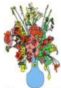
Flowers This Week

Altar flowers this week are dedicated to