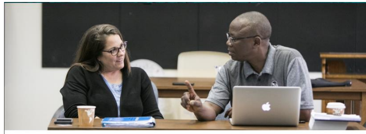
Connecting with Others: Emotional Intelligence