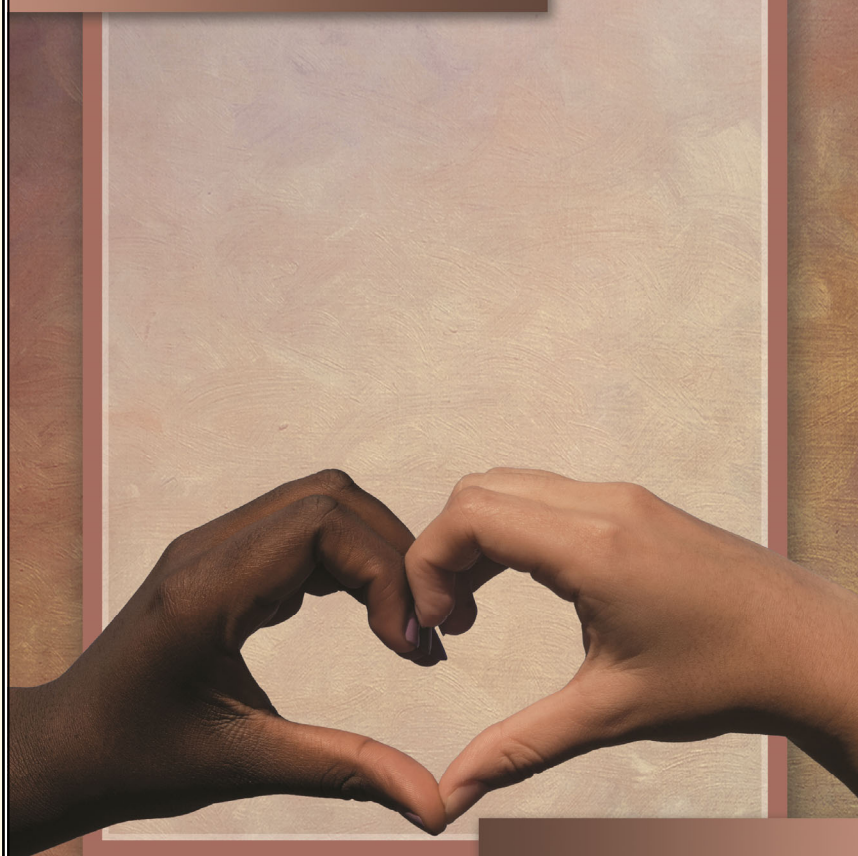
Copyright © J.S. Paluch Co. Inc. Excerpts from the Lectionary for Mass © 2001, 1998, 1997, 1986, 1976, CCD.

We can never love our neighbor too much. —St. Francis de Sales